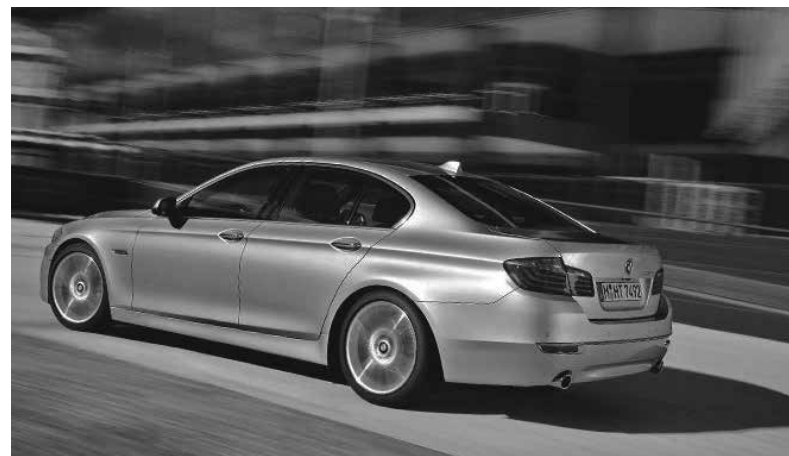
Reference vehicle is 2015 BMW 5-series. (For illustration purpose only)